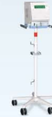
Dräger Babylog 8000 Plus Infant Ventilator