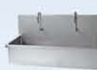
Double Scrub Sink