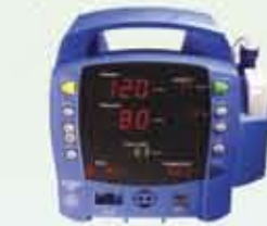
GE Dinamap Pro 400 Vital Signs Monitor (Mobile)