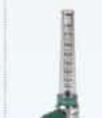
O 2 Flowmeter