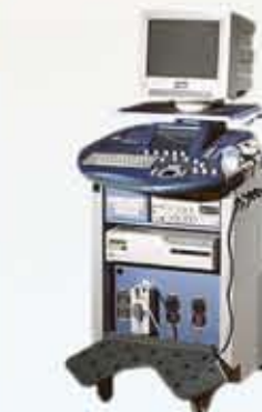
GE Voluson 730 Expert Ultrasound