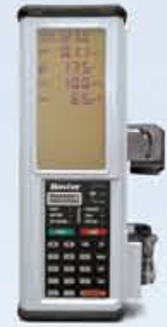
Baxter AS50 Syringe Pump