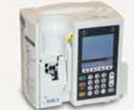
Baxter Colleague Infusion Pump