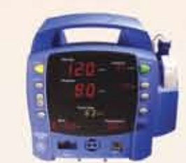
GE Dinamap Pro 400 Vital Signs Monitor (Mobile)