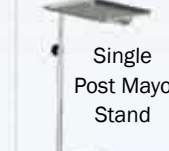
Single Post Mayo Stand