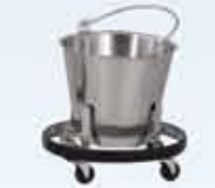
Stainless Steel Kick Bucket and Frame