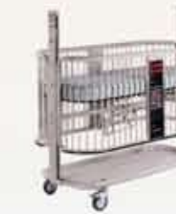
Pedigo 500 Infant Stretcher