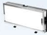
X-Ray View Box