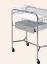
Infant Bassinet and Frame