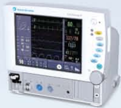
GE Cardiocap/5 Anesthesia Monitor