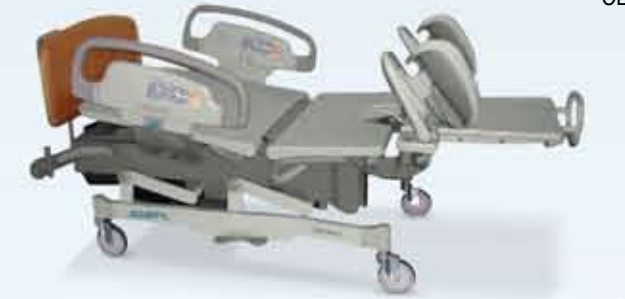
Hill-Rom Affinity II Hospital Bed