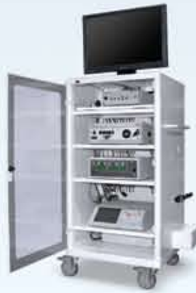
Endoscopy Cart with Stryker 988 System