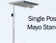
Single Post Mayo Stand