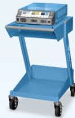
Valleylab Force 2 Electrosurgical Unit (shown with cart)