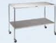
Pedigo SG-82-SS Back Table SS