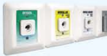
Headwall Simulation System