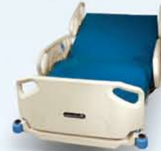
Hill-Rom Hospital Beds