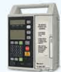
Baxter Flo-Gard 6201 Infusion Pump