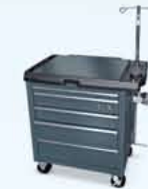
DRE Crash Cart