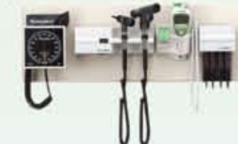
Welch Allyn 767 Diagnostic System