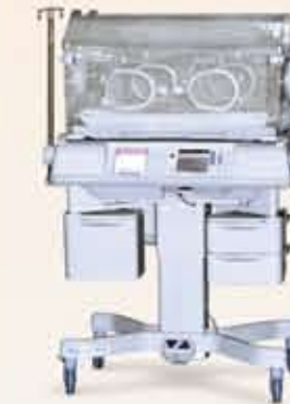
Dräger C-2000 Incubator