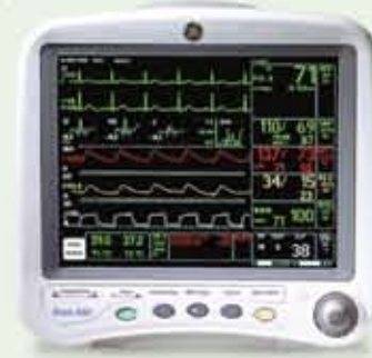
GE Dash 4000 Patient Monitor (Bedside)