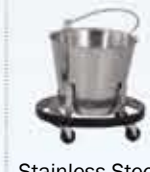
Stainless Steel Kick Bucket and Frame