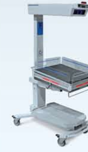
Air-Shields IICS Infant Warmer