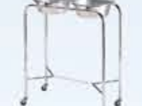
Basin and Stand