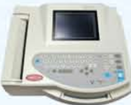
GE MAC 1200 ECG System