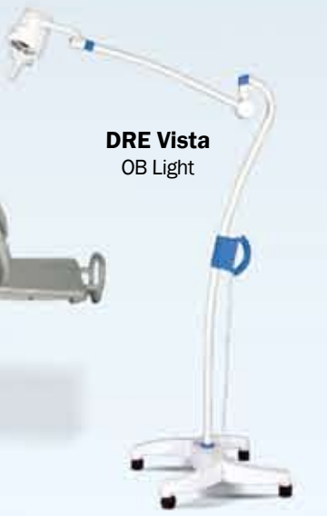
DRE Vista OB Light