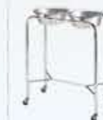
Basin and Stand