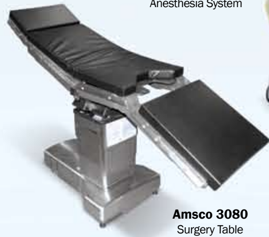
Amsco 3080 Surgery Table