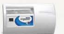
Kendall 7325 Response SCD Sequential Compression Device