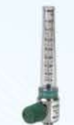
O 2 Flowmeter