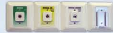
Headwall Simulation System