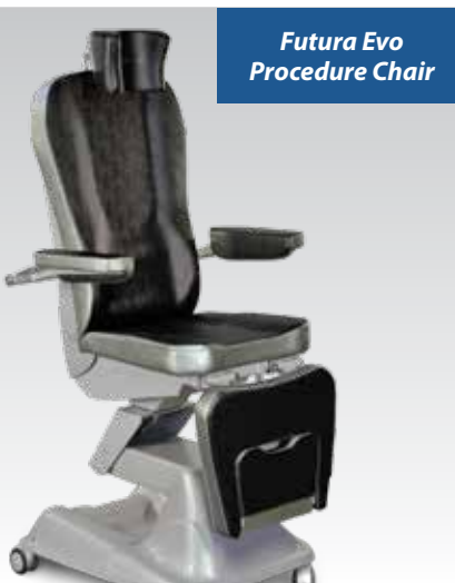
Futura Evo Procedure Chair